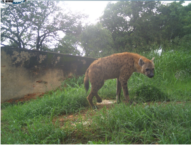
Figure 6. Unknown adult hyaena at Kumbali farm.