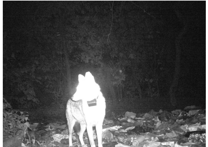
Figure 3. Collared Side Striped Jackal in Lilongwe

We have been keeping a close eye on our side striped jackal in Lilongwe. She was radio collared in 2017 and we are in process of baiting and preparing capture sites with plans to capture her to remove the collar after providing us with valuable data and insights into urban carnivore ecology.