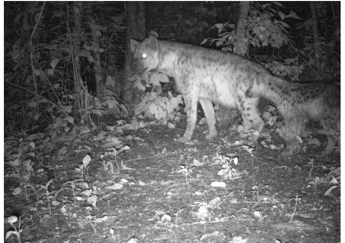
Figure 9. URBHY01 & cub in nature sanctuary