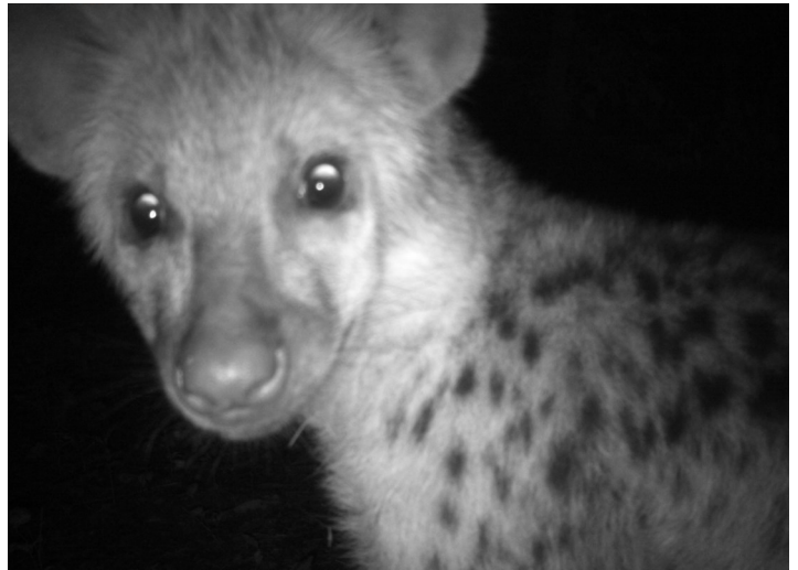
Figure 10. Healthy hyaena cub in the sanctuary