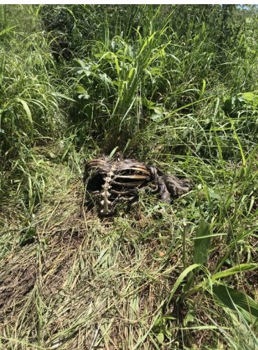
Figure 2. Carcass of a cow at Kumbali Farm

This month we had an opportunity to install a temporary camera at Kumbali farm. This was due to a cow being put down due to injury and perfect for the hyenas to feed on (Figure 2).