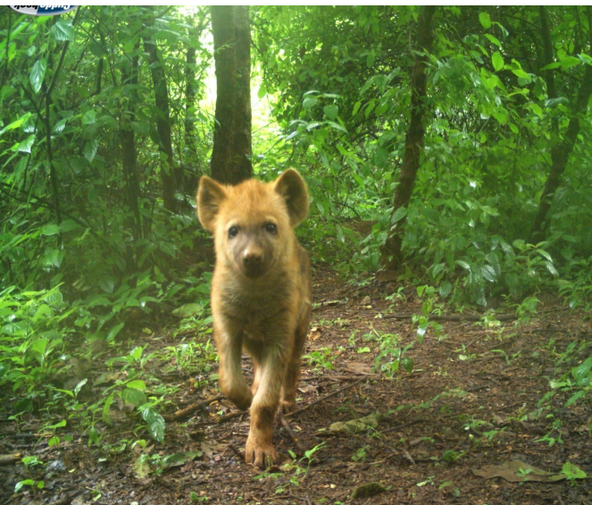
Figure 1. Hyaena cub

A very happy New Year to everyone! 2021 has been exciting so far as our little hyaena cub has been growing and looks very healthy (Figure 1). The CRM team have been continuing with regular camera checks within Lilongwe city. It has been a busy month planning for our upcoming collaring program.