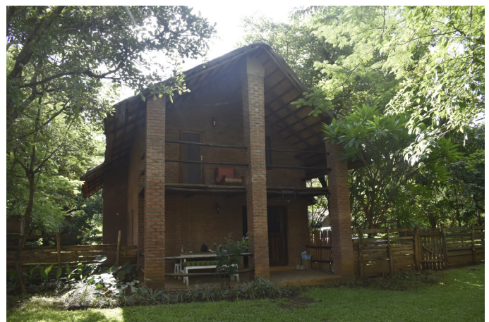
Figure 4. CRA staff accommodation at Barefoot Lodge and Safaris

We are excited to begin a partnership with Barefoot Lodge and Safaris. Our urban team now resides in a lovely thatched safari style house (Figure 4) and volunteers and students will stay in their dorm rooms and enjoy the lush grounds, birds, bats and hyaenas that frequent the area.