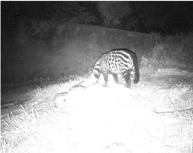
Figure 7. African Civet captured in Kumbali