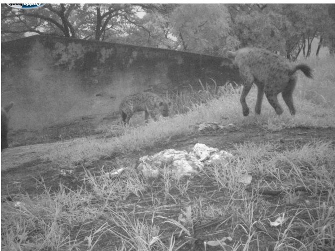
Figure 8. URBHY16 & unknown hyaena in Kumbali